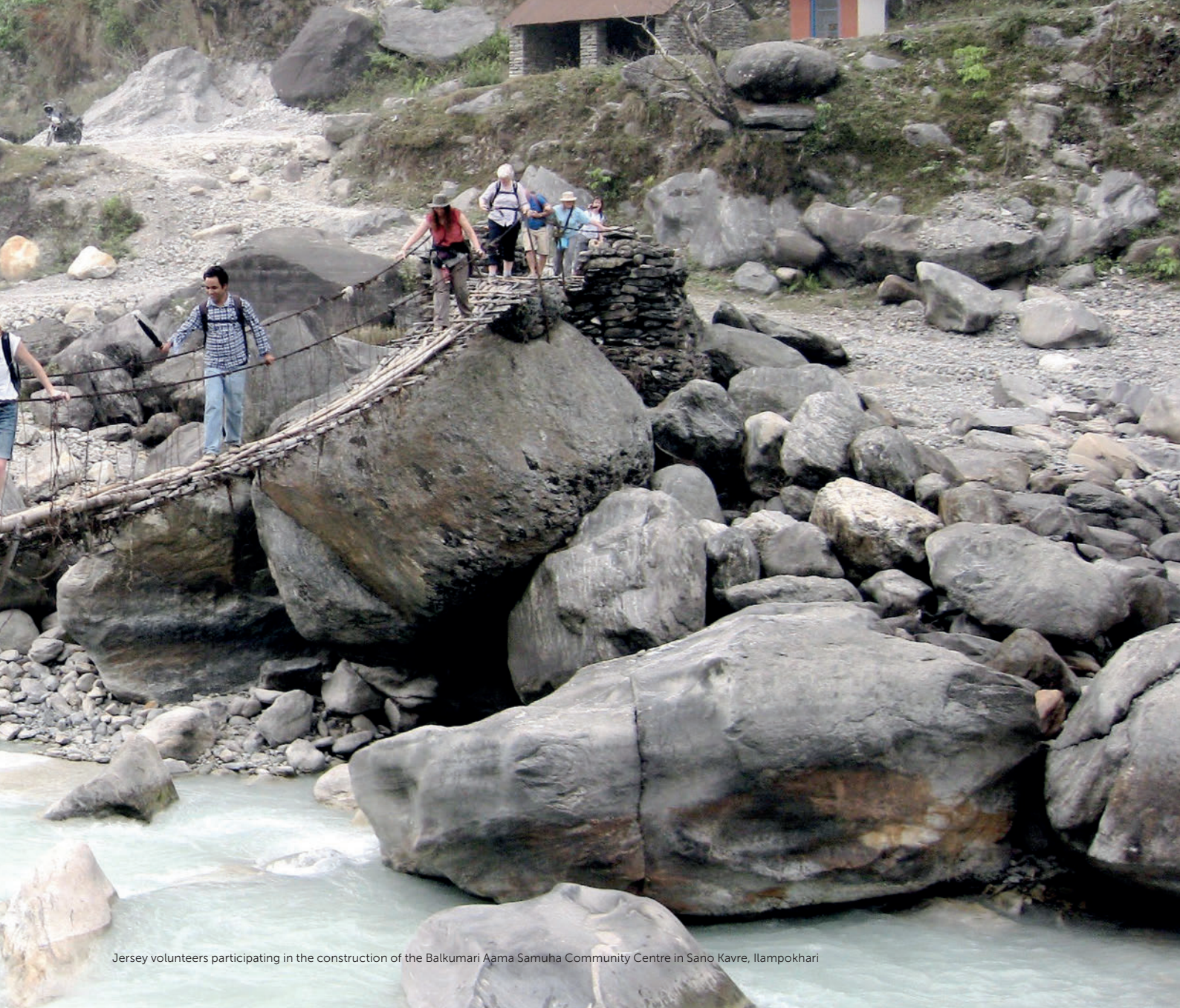
Jersey volunteers participating in the construction of the Balkumari Aama Samuha Community Centre in Sano Kavre, Ilampokhari